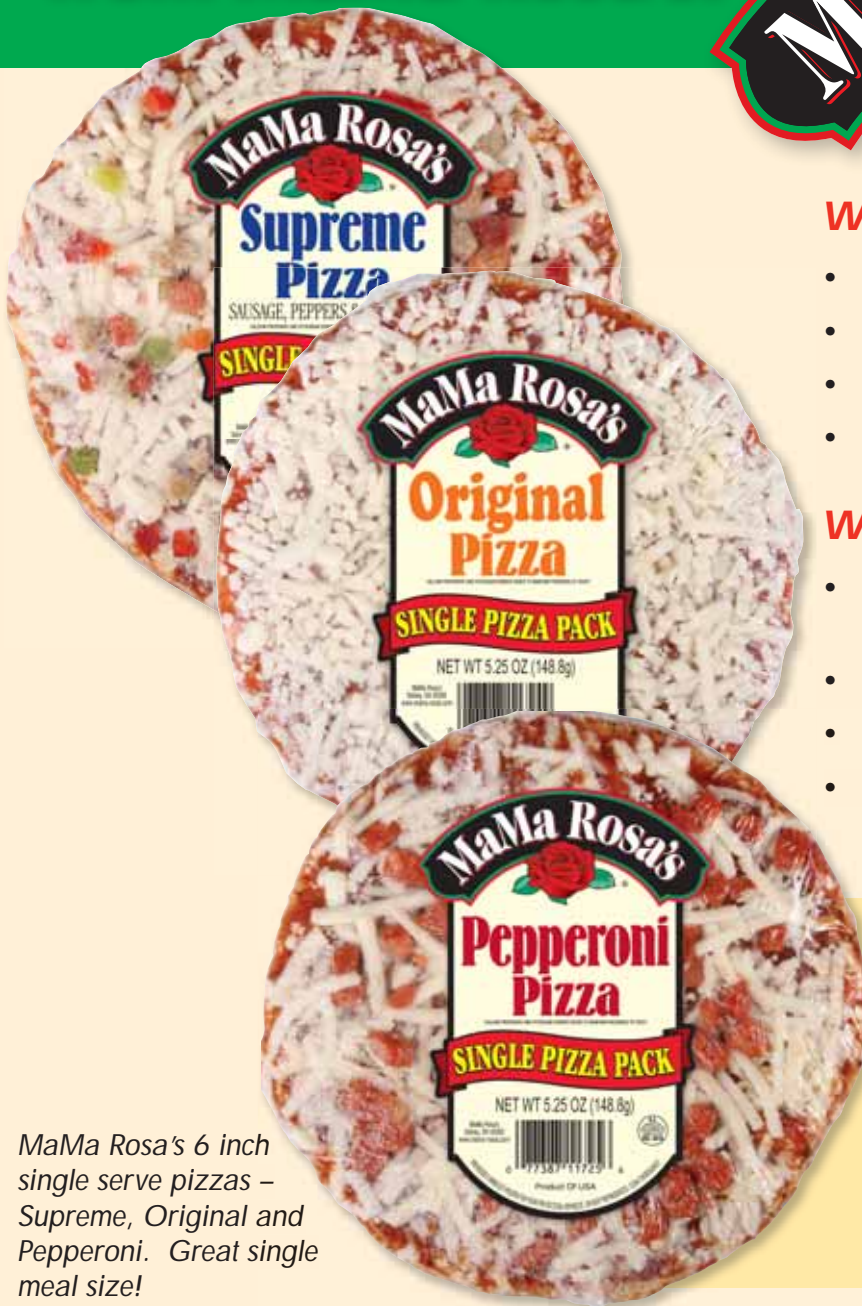
MaMa Rosa's 6 inch single serve pizzas – Supreme, Original and Pepperoni. Great single meal size!