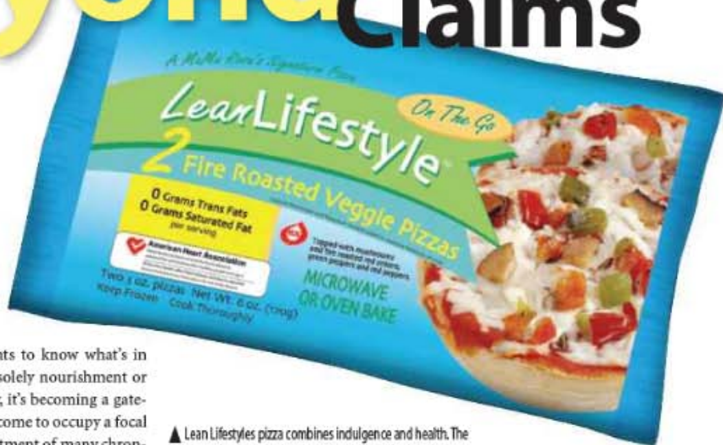
▲ Lean Lifestyle's pizza combines indulgence and health. The whole-grain pizzas are low in cholesterol and high in fiber.

Consumers scrutinize health-centric food choices on more than nutrition alone.